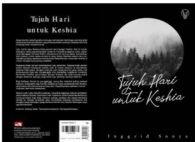
Figure 2. The Novel Tujuh Hari untuk Keshia